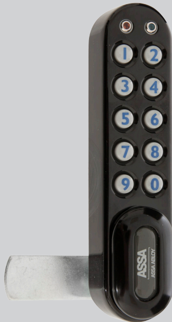
ASSA CODED 1.0 vertical

ASSA ABLOY, the global leader in door opening solutions