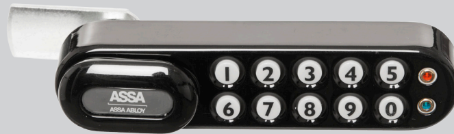
ASSA CODED 1.0 right