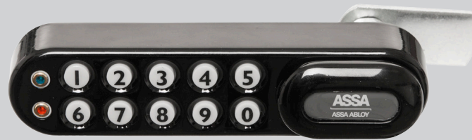
ASSA CODED 1.0 left